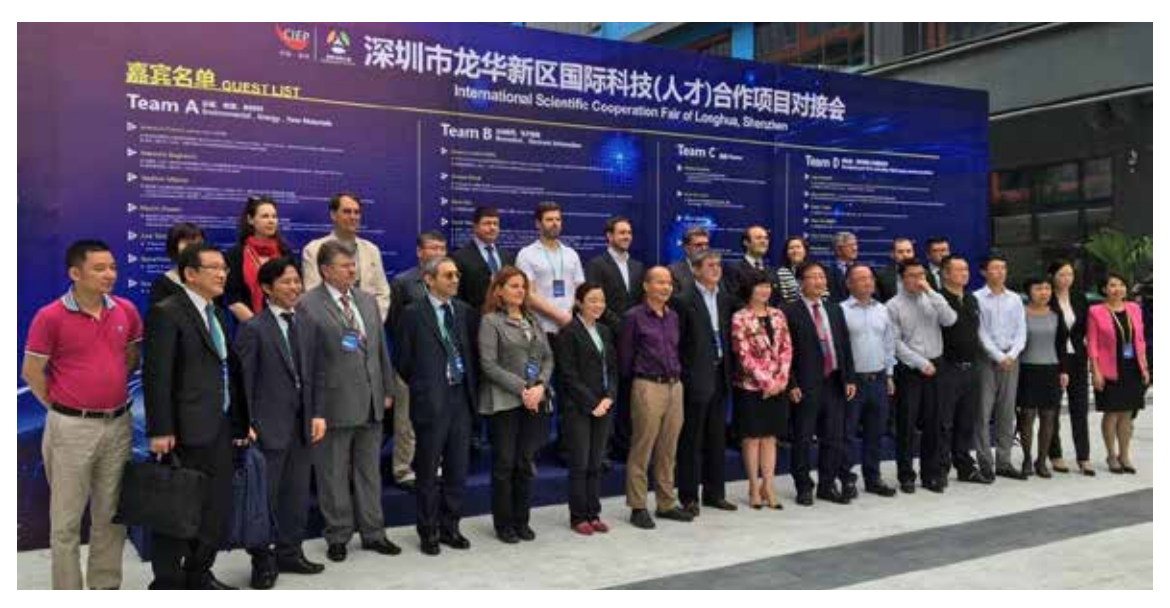
Group picture of the participants to Longhua New District visit

During the visit to the Longhua New District, finally, the participants had the chance to directly observe the design and implementation of talents and investments attraction policies in specific districts in order to make those areas suitable for innovative activities.